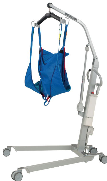
Patient hoist EPL 175E with electric leg opening