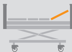
ADJUSTABLE BACK SECTIONS