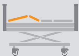
ADJUSTABLE LEG SECTIONS