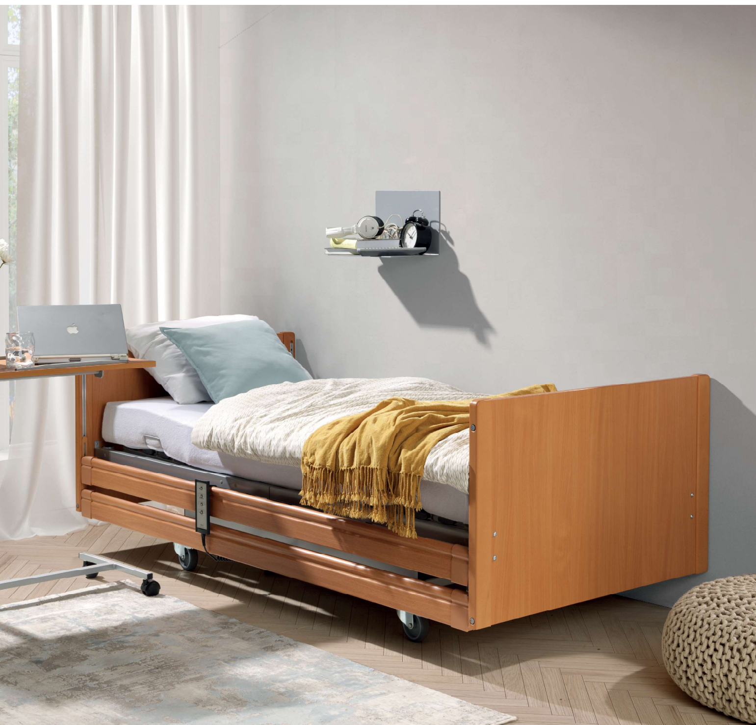
In the picture: PB 526 bed, dimensions 90×200 cm, beech. Accessorise: table Rubens 9, beech.

The most popular bed with a scissor lift system in Elbur offer. High quality, solid workmanship of the bed with many width and length possibilities and a large selection of colours and end boards, means this model is often chosen as equipment for care facilities.