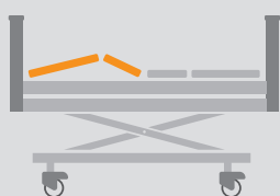
ADJUSTABLE LEG SECTIONS