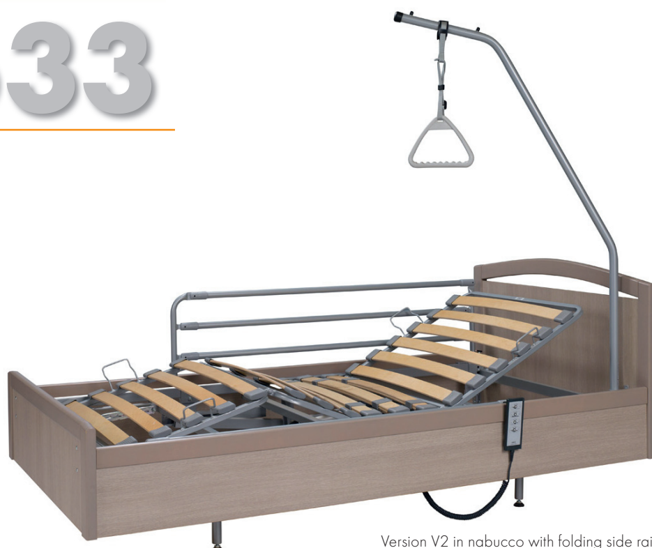
Version V2 in nabucco with folding side rail