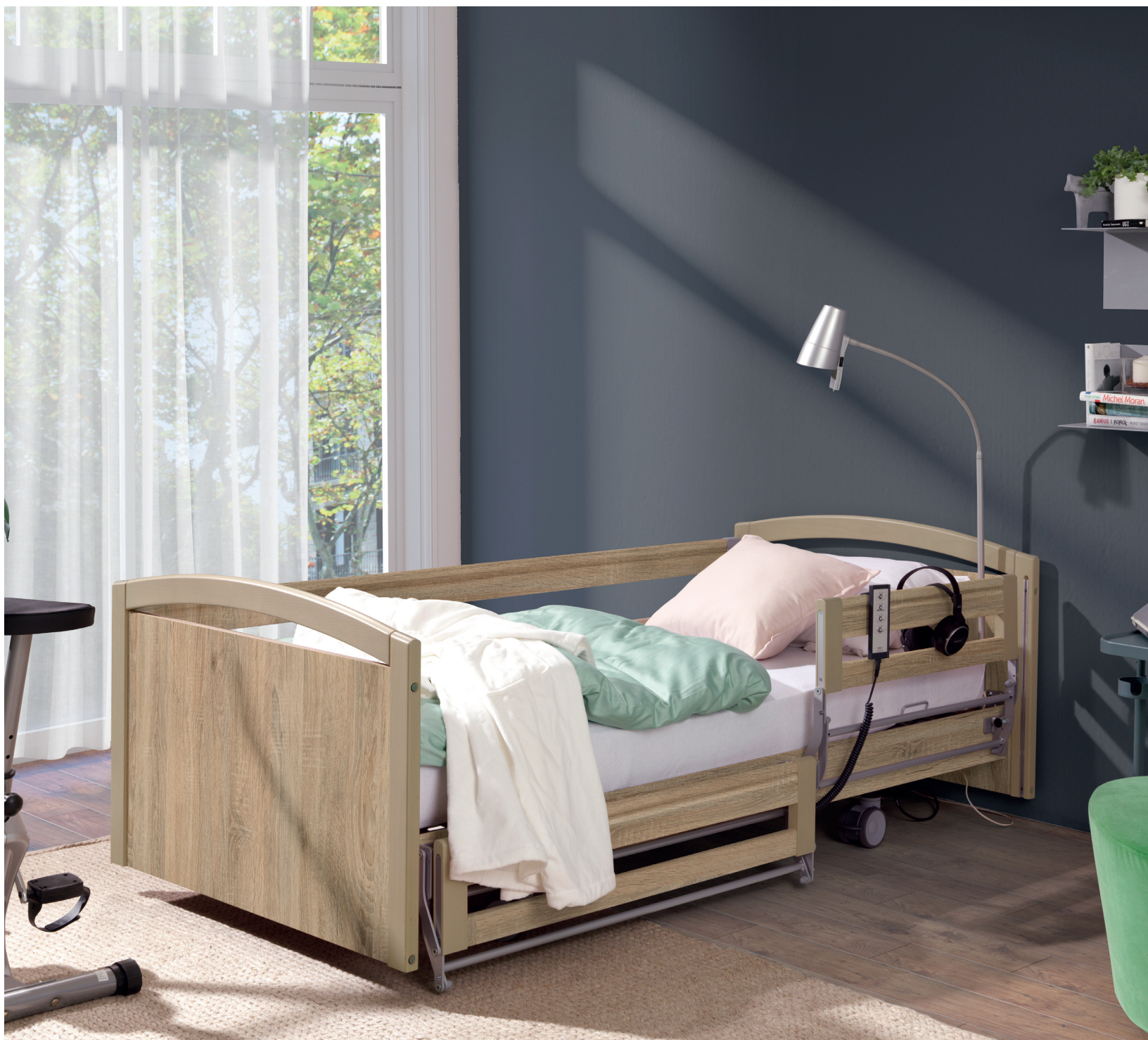
In the picture: PB 636 bed sonoma oak, with divided rails on one side of the bed. Accessories: bedside lamp.

A special feature of the PB 636 bed is the possibility of lowering the mattress platform down to a level of 29 cm. The low position allows for increased comfort and significantly reduces the possibility of injury in the situation of accidental falls out. The height adjustment range allows caregivers to work in optimal conditions. The possibility of using the divided side rails means that the user does not have to be restricted by the side rails in the bed.