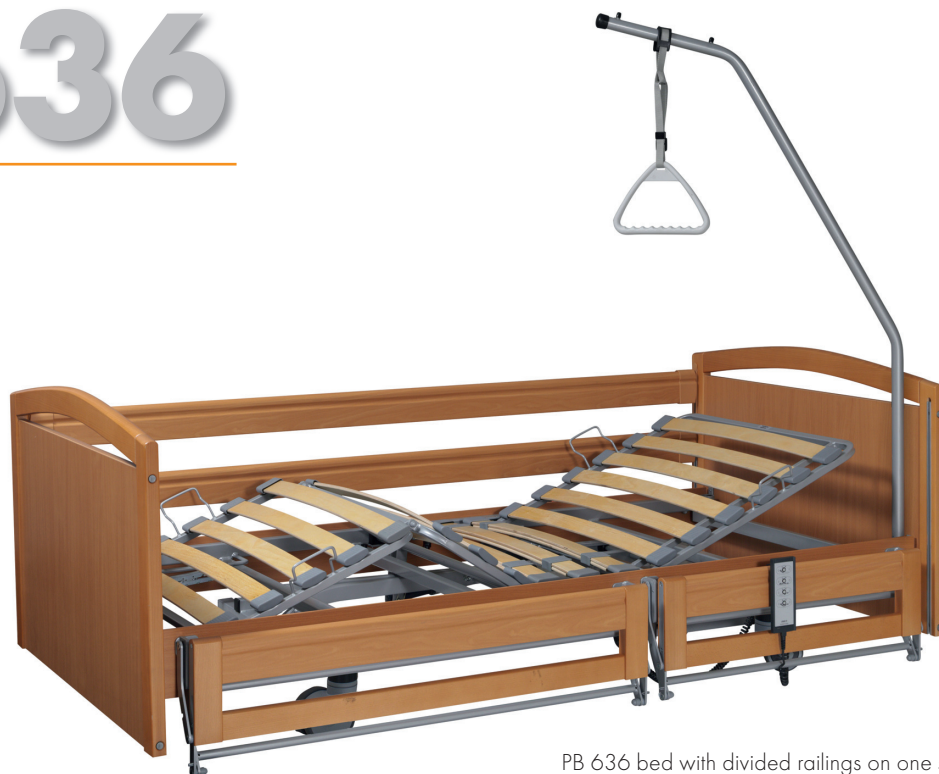
PB 636 bed with divided railings on one side