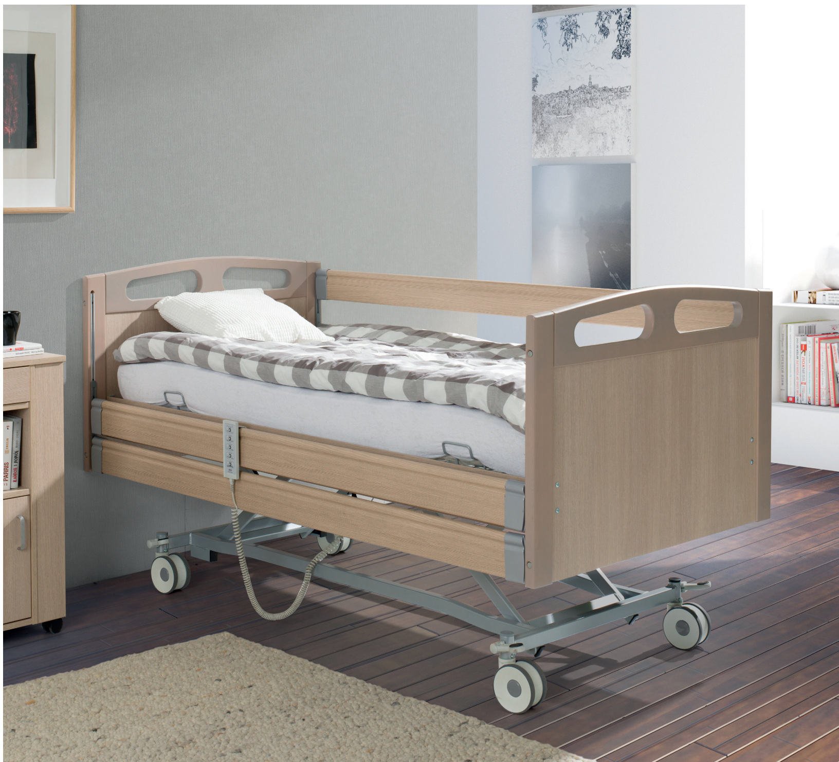
In the picture: PB 735 bed in maple, standard design.

The PB 735 bed is for high dependency users. Unique technical parameters such as increased load, the „comfort” position, the integrated extension of the mattress support platform, autoregression function and the low position of the mattress support platform make it a good choice for care facilities and private homes.